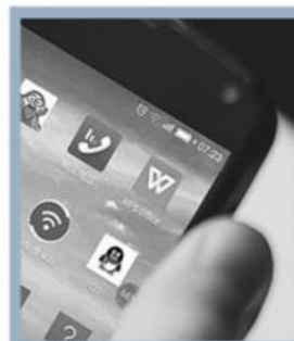
WiFi signal is unstable