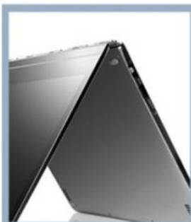
Light and thin without network port

Easy to solve the following problems for you