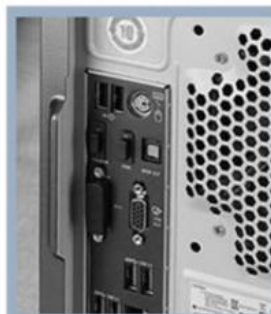
The network port of desktop computer is damaged