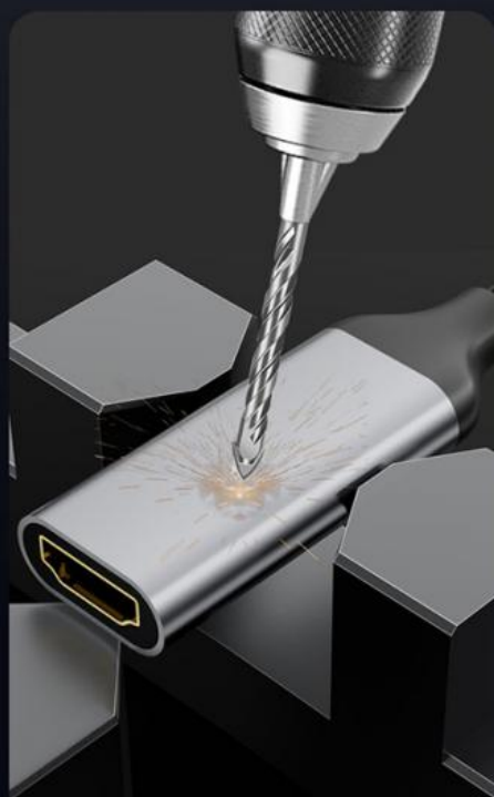
Premium Aluminum Shell