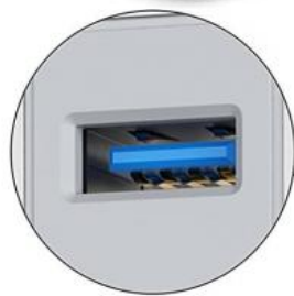
7 USB 3.1 Gen2 Ports