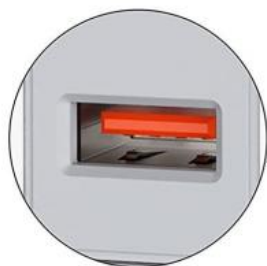
1 Quick Charge 3.0 Port