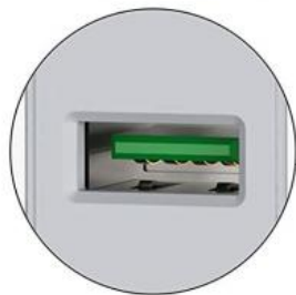
2 INT-POWER Fast Charging Ports