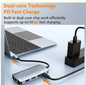
Dual-core Technology PD Fast Charge Built-in dual-core chip work efficiently Supports up to 100W fast charging