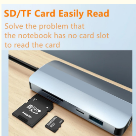
SD/TF Card Easily Read Solve the problem that the notebook has no card slot to read the card