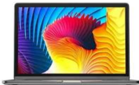
MacBook Air / Pro 13"